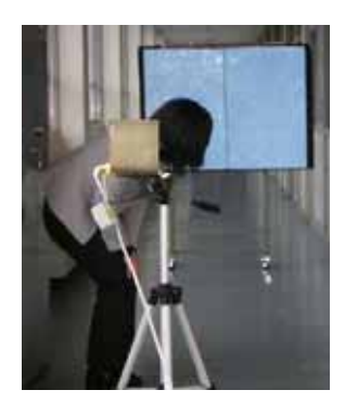
Fig.7 The method of observing