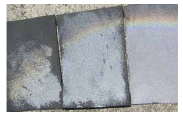
Fig 4. The \quad diameter \quad is \quad from \quad left \quad to \\ right : 0.71\text{--}1.00, 0.50\text{--}0.71, 0.21\text{--}0.30mm

We can observe the rainbow of the Soda-lime Glass Beads under very wide range of their