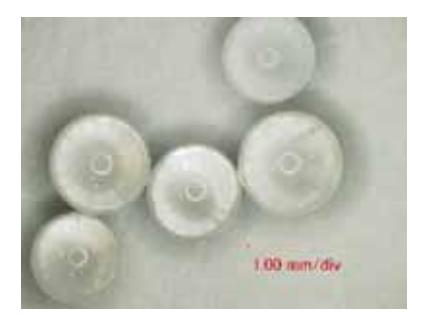
Fig.3 Microscopic view of glass beads