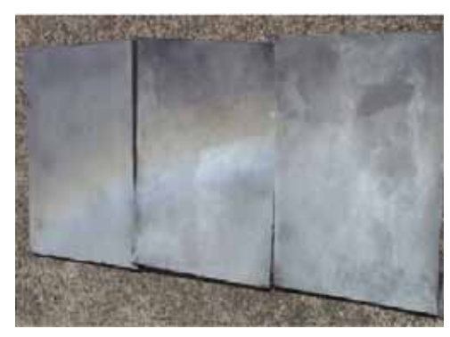
Fig 5. The \quad diameter \quad is \quad from \quad left \quad to \\ right : 0.075 \hbox{-} 0.106 , 0.053 \hbox{-} 0.075 , 0.038 \hbox{-} 0.041 mm