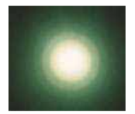
Fig.6 Halo by glass beads

To observe a halo as Fig.6, we throw light from a point source over beads pasted on transparent sheet. The diameters of the halo beads range for 0.02mm to 0.1mm. Halo is produced by both transparent and opaque glass beads.